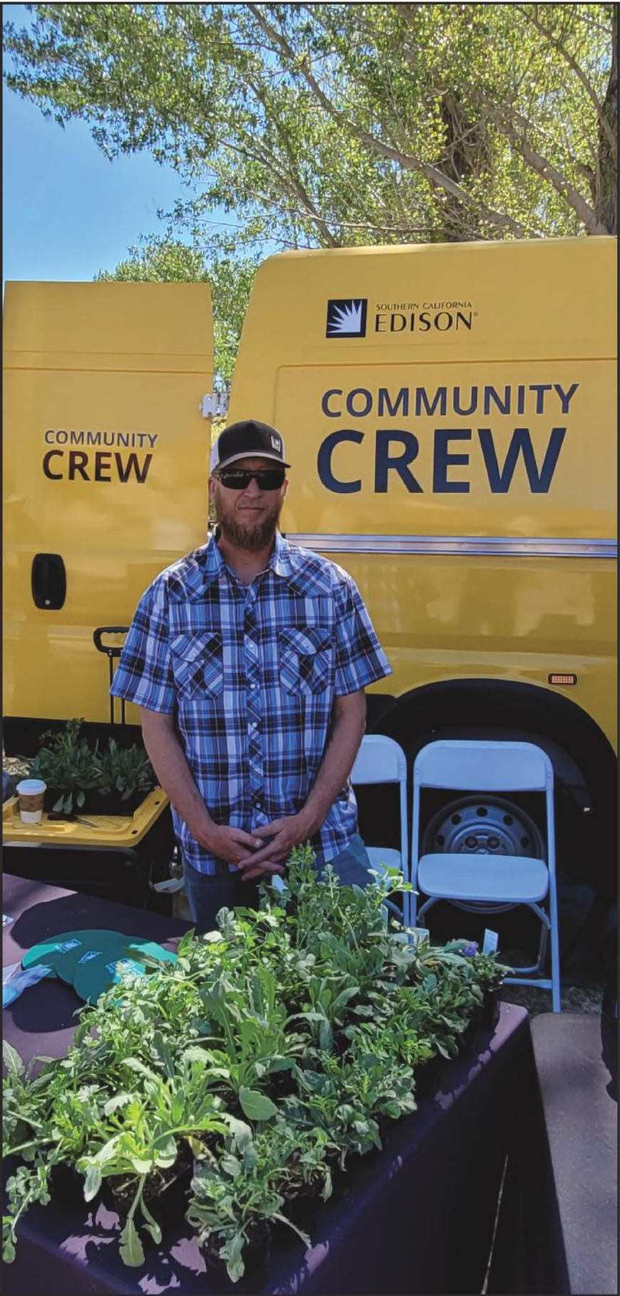
Highlights of the Earth Day celebrations at the Paiute Shoshone Cultural Center included the much anticipated Native Fish Refuge, and the successful relocation of the Owens Pupfish, along with other native fish species to the reservation's Native Fish Refuge. The lengthy endeavor began back in 2012, when the tribe was ready to receive the endangered fish, and the tribe has been working with the state's Department of Fish and Wildlife, and the permit includes a "Safe Harbor" agreement, which will ensure the Bishop Paiute Tribe won't see greater restrictions on their land use, if these endangered species do well. It's a historic moment for the tribe. Congratulations.

There are several Youth Fly Fishing Camps at the Bishop City Park, and in southern Inyo County there is a Kids Free Fishing Day at the Mt. Whitney Fish Hatchery, Independence, CA (Saturday, April 27, from 9 am – 12 pm), and a Trout Derby at Diaz Lake, south of Lone Pine, CA, Saturday, April 27, 6 am – 3 pm (put on by the Lone Pine Chamber of Commerce with free coffee and doughnuts at sign in), and remember...anyone 16 years of age and older needs a California fishing license. As for Earth Day, and the benefits of fishing, well, let us count the ways to cast on the successes. Conservation efforts include catch and release, lead-free weights, barbless hooks, and biodegradable fishing lines, and then there's the reel / real reasons we fish. Relaxation. Enjoy nature. A way to spend quality time with friends and family. It builds community. Happy fishing everyone!